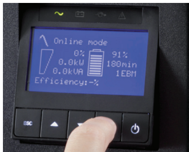
9SX LCD tilts 45° for ease-of-viewing