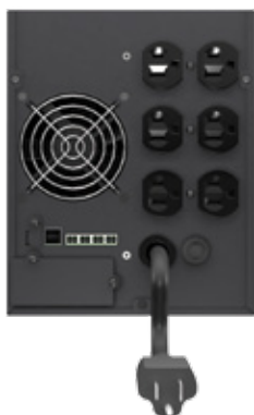
Liebert GXT3 mini-tower model provides 1000VA capacity in a compact design.